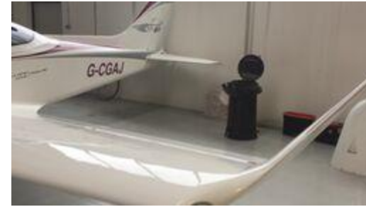
Different shots of the P400 at Pordenone