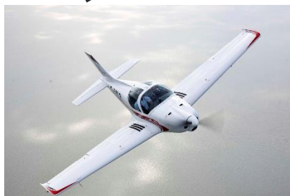
P300 Complex LSA Griffon 100 and 135 HP