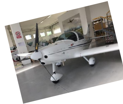
P200 3 Axis Microlite